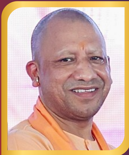
Yogi Adityanath Chief Minister Uttar Pradesh